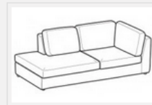
Lateral angular element

Width: 101cm Depth: 248cm Height: 81cm Volume: 1,51 m 3 Weight: 57kg