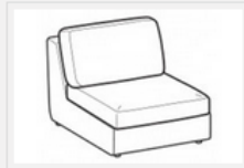
1-er central element

Width: 75cm Depth: 101cm Height: 81cm Volume: 0,47 m 3 Weight: 24kg