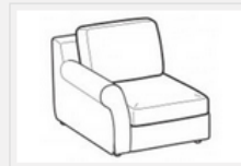
1-er lateral element

Width: 99cm Depth: 101cm Height: 81cm Volume: 0,62 m 3 Weight: 31kg