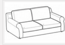
2-er maxi sofa

Width: 198cm Depth: 101cm Height: 81cm Volume: 1,21 m 3 Weight: 59kg