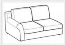
2-er lateral element

Width: 157cm Depth: 101cm Height: 81cm Volume: 0,96 m 3 Weight: 46kg