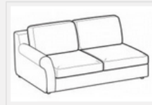
2-er maxi lateral element

Width: 174cm Depth: 101cm Height: 81cm Volume: 1,07 m 3 Weight: 49kg