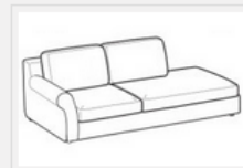
3-er w/footstool and arm

Width: 256cm Depth: 101cm Height: 81cm Volume: 1,56 m 3 Weight: 59kg