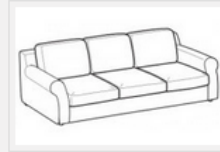
3-er maxi sofa

Width: 248cm Depth: 101cm Height: 81cm Volume: 1,51 m 3 Weight: 70kg