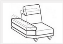
1-er lateral element

Width: 95cm Depth: 105cm Height: 78-99cm Volume: 0,88 m 3 Weight: 32kg