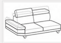
3-er maxi lateral element

Width: 198cm Depth: 105cm Height: 78-99cm Volume: 1,79 m 3 Weight: 64kg