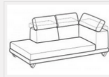
Lateral angular element

Width: 104cm Depth: 224cm Height: 78-99cm Volume: 2,00 m 3 Weight: 67kg