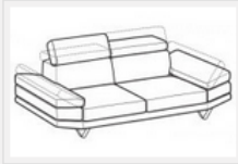
3-er maxi sofa

Width: 230cm Depth: 105cm Height: 78-99cm Volume: 2,07 m 3 Weight: 74kg