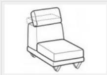
1-er central element

Width: 64cm Depth: 105cm Height: 78-99cm Volume: 0,61 m 3 Weight: 22kg