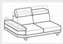
3-er lateral element

Width: 178cm Depth: 105cm Height: 78-99cm Volume: 1,61 m 3 Weight: 58kg