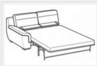
3-er lateral element bed with electro-welded base

Width: 156cm Depth: 95-240cm Height: 93cm Volume: 1,50 m 3 Weight: 58kg