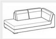
Lateral angular element

Width: 94cm Depth: 218cm Height: 93cm Volume: 2,07 m 3 Weight: 67kg