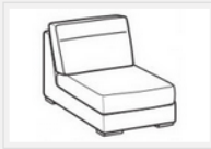
1-er maxi central element

Width: 64cm Depth: 95cm Height: 93cm Volume: 0,64 m 3 Weight: 14kg