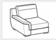
1-er maxi lateral element

Width: 92cm Depth: 95cm Height: 93cm Volume: 0,90 m 3 Weight: 23kg