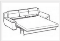
3-er maxi bed with electro-welded base

Width: 224cm Depth: 95-240cm Height: 93cm Volume: 2,14 m 3 Weight: 86kg