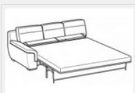
3-er maxi lateral element bed with electro-welded base

Width: 196cm Depth: 95-240cm Height: 93cm Volume: 1,88 m 3 Weight: 74kg