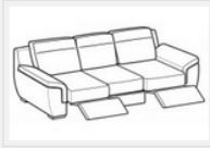
3-er maxi Sofa with 2 relax

Width: 224cm Depth: 95-146cm Height: 93cm Volume: 2,14 m 3 Weight: 106kg