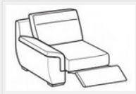
1-er maxi lateral element with 1 relax

Width: 92cm Depth: 95cm Height: 93cm Volume: 0,90 m 3 Weight: 41kg