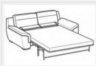
3-er sofa bed with electro-welded base

Width: 184cm Depth: 95-240cm Height: 93cm Volume: 1,77 m 3 Weight: 70kg