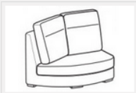
Rounded end element

Width: 125cm Depth: 125cm Height: 93cm Volume: 1,58 m 3 Weight: 32kg