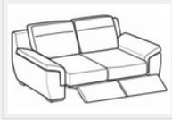
2-er Sofa with 2 relax

Width: 168cm Depth: 95-146cm Height: 93cm Volume: 1,62 m 3 Weight: 85kg