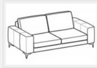
2-er maxi sofa

Width: 188cm Depth: 96cm Height: 84cm Volume: 1,42 m 3 Weight: 56kg