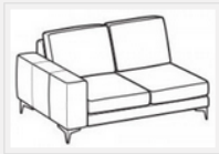
2-er lateral element

Width: 140cm Depth: 96cm Height: 84cm Volume: 1,07 m 3 Weight: 38kg