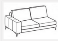
2-er maxi lateral element

Width: 170cm Depth: 96cm Height: 84cm Volume: 1,29 m 3 Weight: 46kg