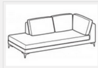
Lateral angular element

Width: 94cm Depth: 220cm Height: 84cm Volume: 1,63 m 3 Weight: 67kg