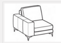
1-er lateral element

Width: 79cm Depth: 96cm Height: 84cm Volume: 0,62 m 3 Weight: 26kg