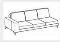
3-er maxi lateral element

Width: 220cm Depth: 96cm Height: 84cm Volume: 1,66 m 3 Weight: 59kg