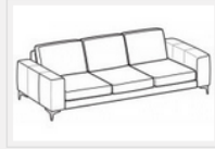
3-er maxi sofa

Width: 238cm Depth: 96cm Height: 84cm Volume: 1,79 m 3 Weight: 69kg