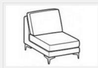
1-er central element

Width: 61cm Depth: 96cm Height: 84cm Volume: 0,49 m 3 Weight: 16kg